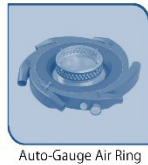
Auto-Gauge Air Ring

When You Need Solutions ...Not Just Answers®